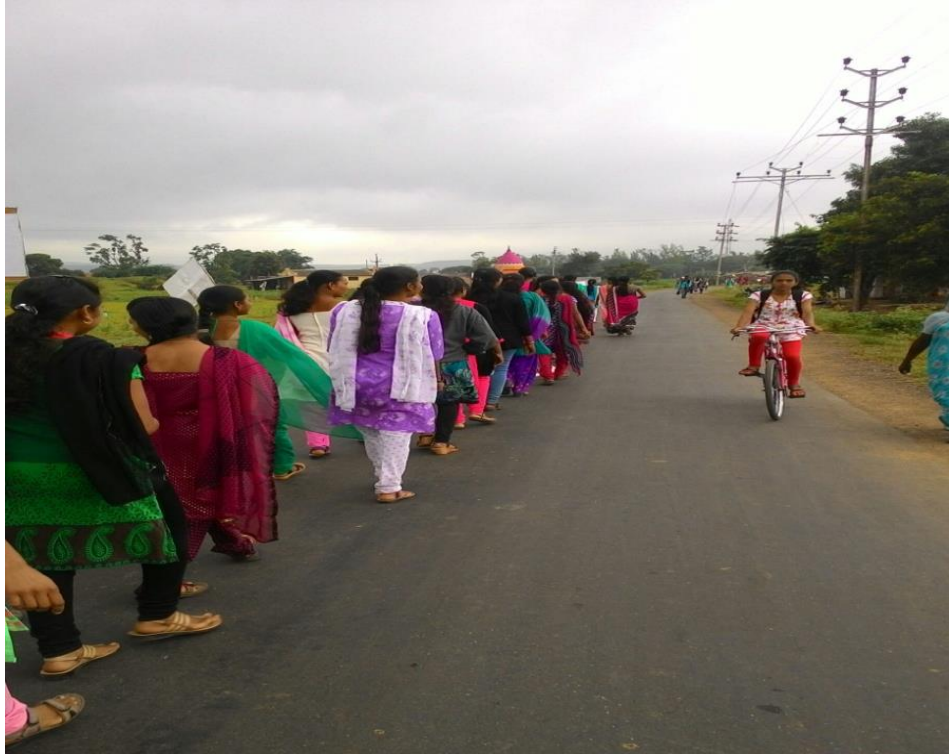
ORGAN DONATION AWARENESS ACTIVITY ON 2017