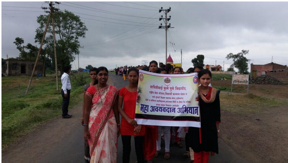
STUDENT CRATING AWARENESS ABOUT ORGAN DONAATION ON 2017