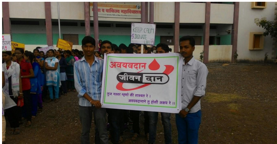
COLLEGE STUDENT IN ORGAN DONATION PROGRAMME ACTIVITY ON 2017