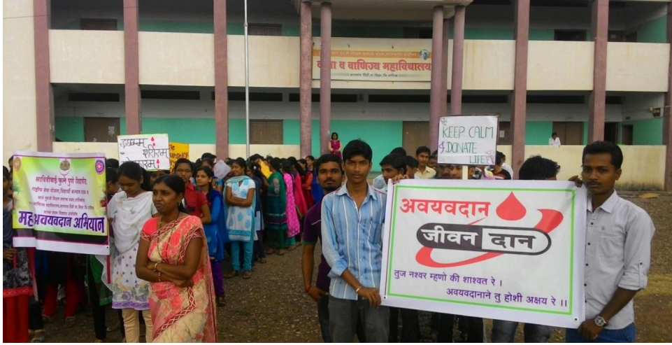
STUDENT PARTICIPATING IN ORGAN DONATION ACTIVITY ON 2017