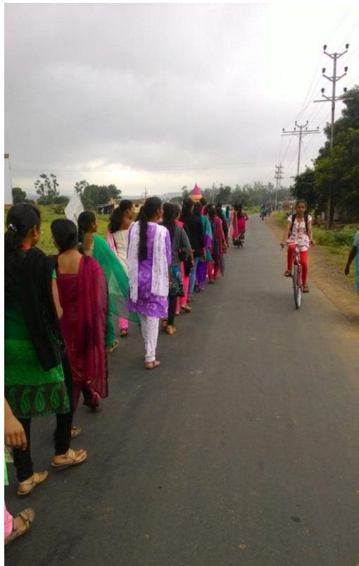
Rally on organ donation in village