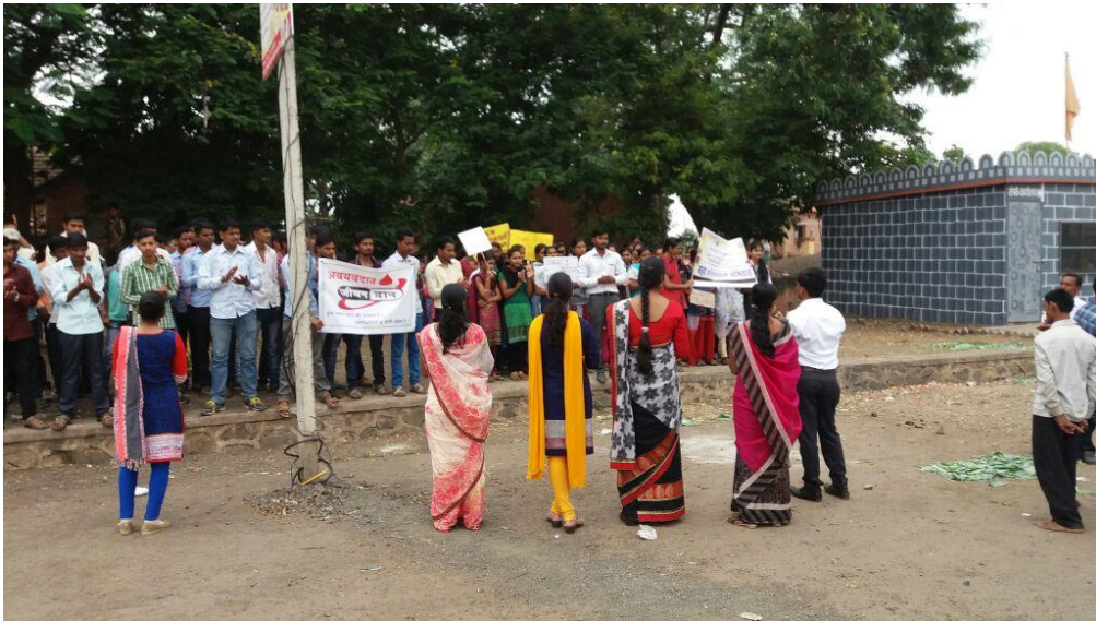
ORGAN DONATION AWARENESS MOVMENT AT VILLAGE ON 2017