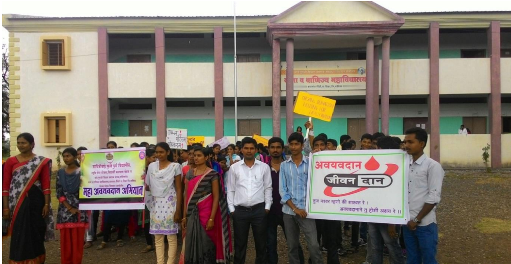
STUDENT & TACHING STAFF IN ORGAN DONATION PROGRAMME IN COLLEGE CAMPUS