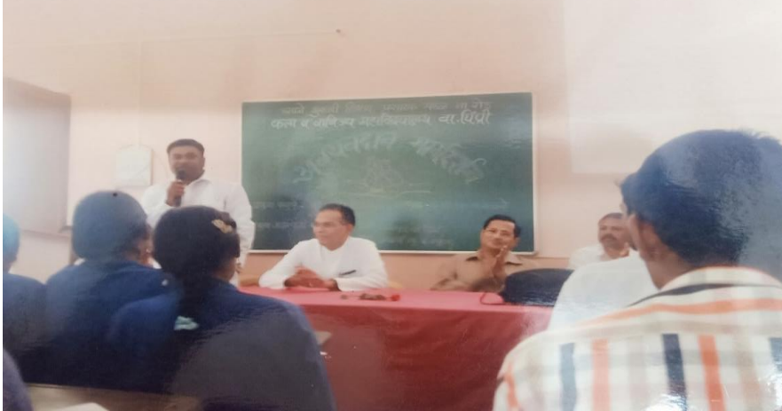
RAMCHANDRA TRUST MEMBER IS GIVING SPEECH ON ORGAN DONATION PROGRAMME ON 2017