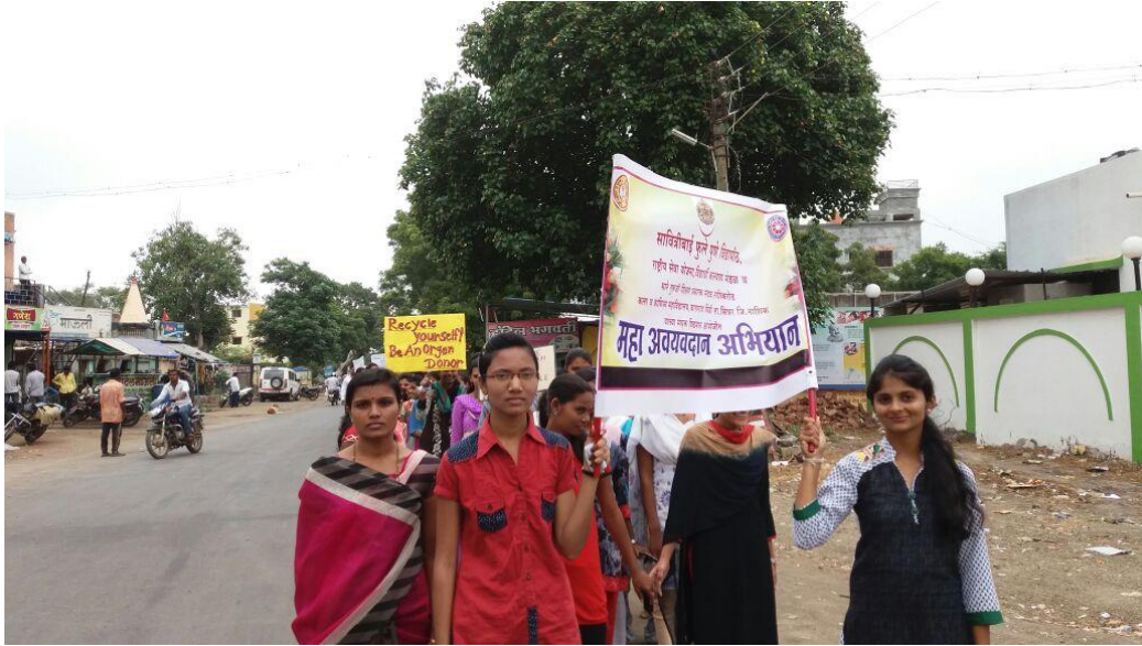
STUDENT DOING ACTIVITY AT VILLAGE ON 2017