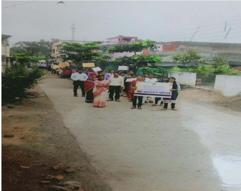
STUDENT DOING AWARENESS ABOUT ORGAN DONATION IN THE VILLAGE ON 2017